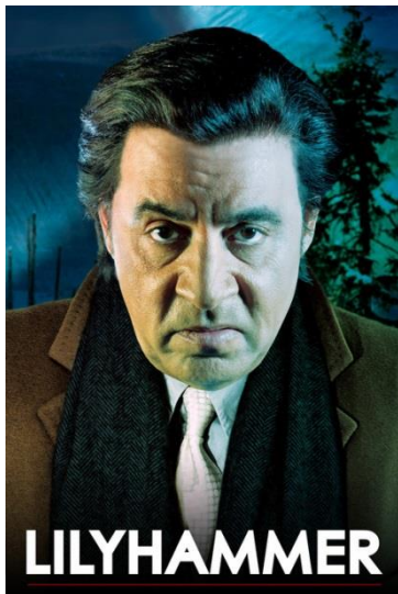
Mu LILYHAMMER d